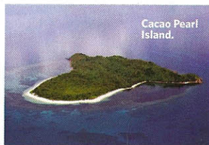
Cacao Pearl Island.