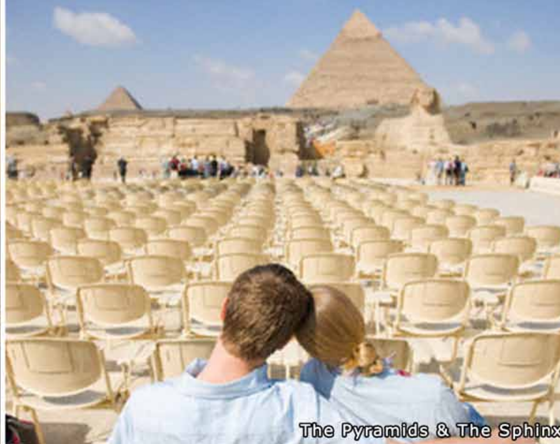
The Pyramids & The Sphinx

The Ministry of Tourism reported that foreign tourists totalled around 12.8 million in 2008, up a strong 15% year-on-year. It is forecast that Egypt will receive over 17 million visitors per year by 2020. The Sinai peninsula is particularly popular with tourists from across Europe, the Middle East and the US and nowhere in the world are there coral walls and gardens more brilliantly abundant, waters more crystalline or underwater life more varied and plentiful.