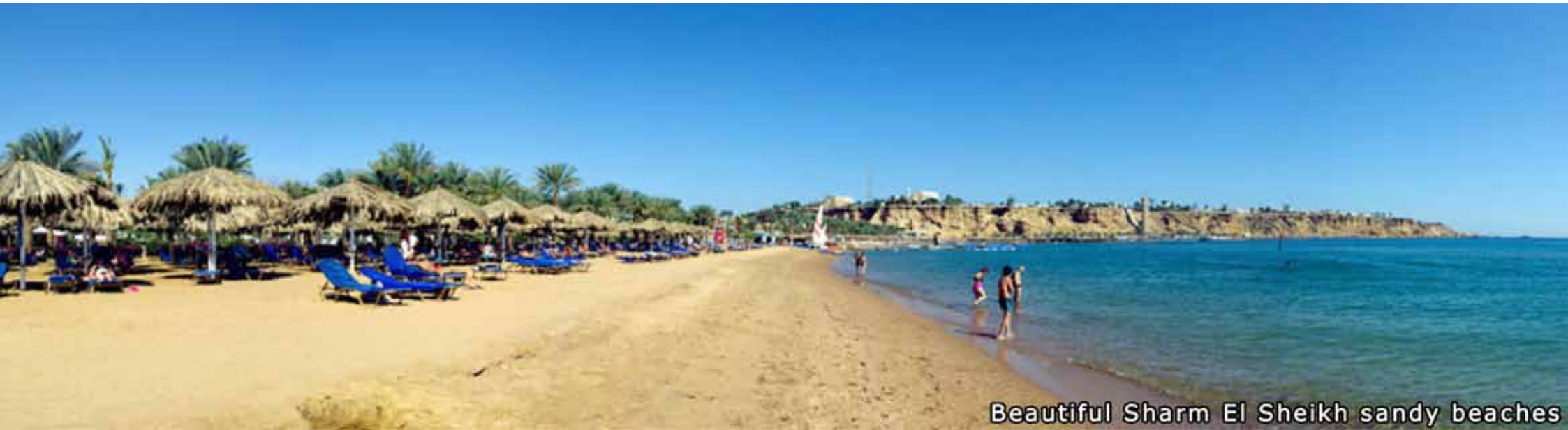
Beautiful Sharm El Sheikh sandy beaches

We very much look forward to working with you.