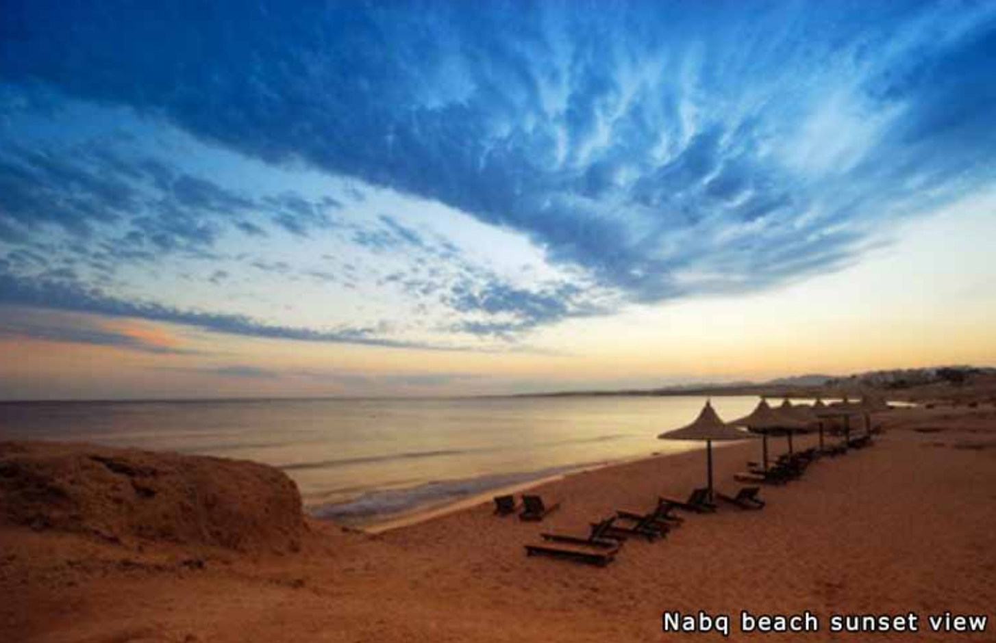
Nabq beach sunset view