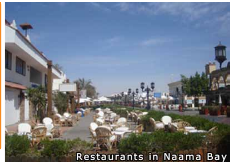
Restaurants in Naama Bay

The law in Egypt allows non-Egyptians to purchase property up to 4,000 sq metres. Property larger than this will require Government approval. The South Sinai region is restricted by the Prime Minister decrees of 2005 and 2007 where purchasers, whether they are Egyptian nationals or not, cannot purchase property freehold. All contracts are set-up as a Usufruct for a period of 99 years. The contracts are signed with a proviso that if the decrees are cancelled, the contract will change to a freehold contract.