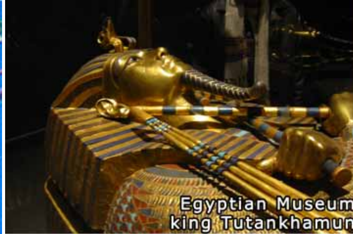
Egyptian Museum king Tutankhamun