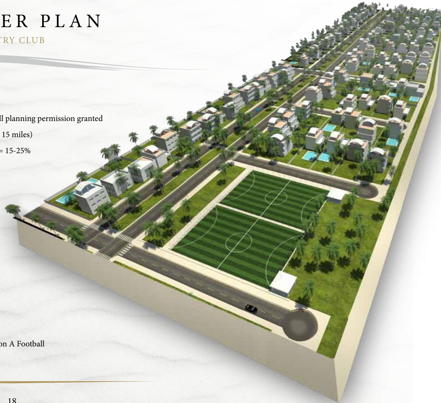
Section A Football